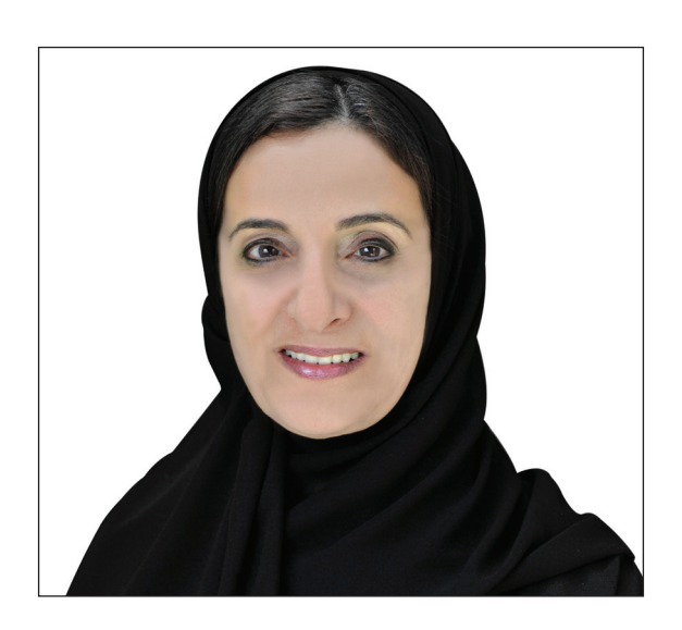
Under the Patronage of